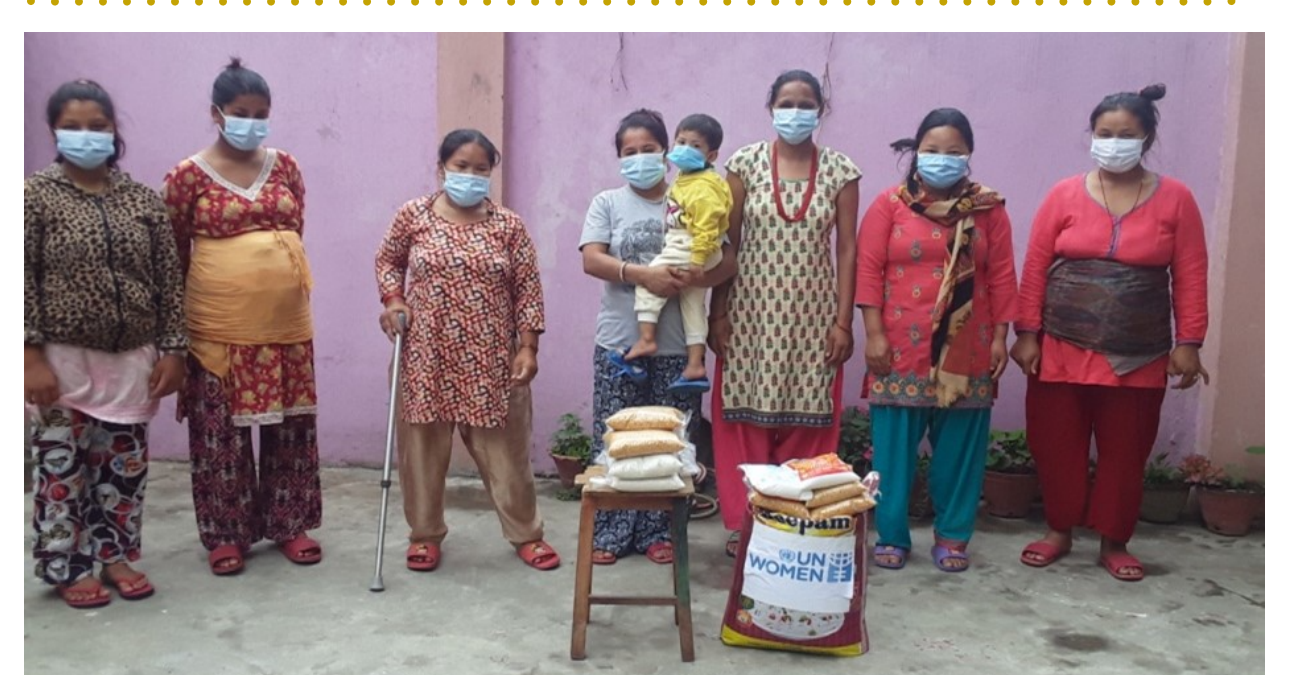
Relief distribution of food items to survivors of domestic violence residing in Saathi's shelter home.

Strengthen private sector engagement to ensure an adequate number of hospital beds available for COVID-19 patients, especially those with moderate and severe cases.